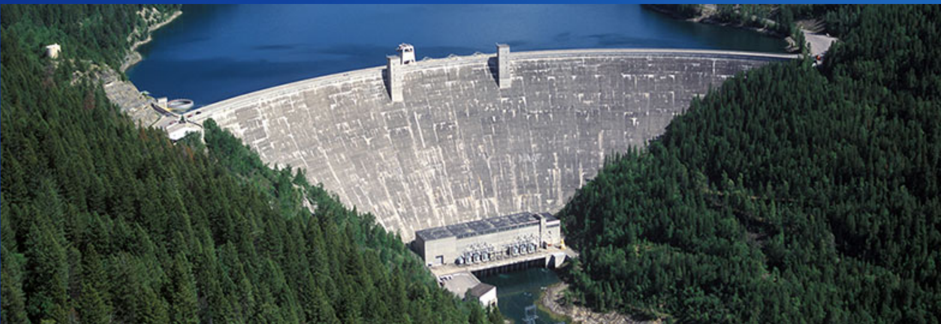
Hungry Horse Dam, MT